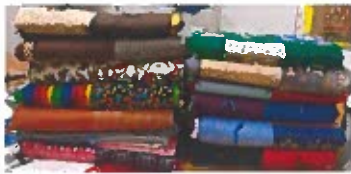
LWR 2021 QUILT SHIPMENT 15 quilts completed and shipped to provide warmth & shelter!

Bible Study : 9:30 am Wednesday, October 6, 2021